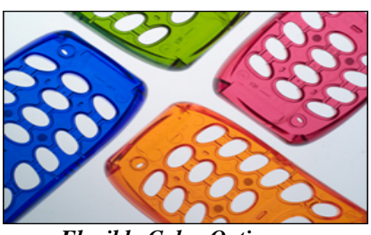
Flexible Color Options